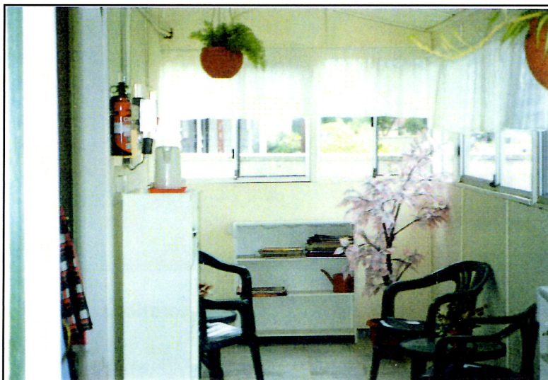
The front verandah, where a cuppa could be enjoyed with friends

1997: Prior to Christmas 1997 a Craft Corner was established and proved to be so successful that in 1998 it was decided to also sell jams and pickles. As a service to the people of Rockingham books were initially exchanged at the shop, but later this ceased and books were sold. This facility was situated on the front verandah, where there were places to sit and tea and coffee making facilities were available. A budget of was allocated for the purchase of tables, chairs, bookshelves, kettle and incidentals needed to establish this facility. The shop aimed to meet the needs of the people in the wider community and where companionship could be found. For health and safety reasons this service had to be discontinued.